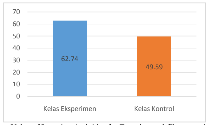
Graph of Average Value of Learning Activities for Experimental Classes and Control Classes

The value of F test for learning activities between the experimental class and the control class is 90.505 and the significance is 0.05. Thus H0.1 is rejected and Ha.1 is accepted. This shows that "There is the influence of Contextual Learning on Student Learning Activities in the Material of the Influence of village urban interaction for SMA N 1 Wonoayu's student class XII IPS.. "Furthermore from the Descriptive Statistics table (Table 4.12) obtained mean learning activities for the experimental class at 62.74 and the mean learning activities for the control class 49.59. This shows that the observation value of learning activities in the experimental class is better than the observation value of learning activities in the control class with a Difference Mean of 13.15. The results of this study are as shown in the following graph: